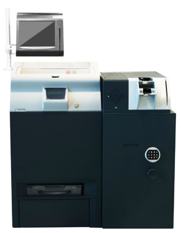
RCS-400 with SDM-504S

The Savoy Hotel had 35-40 float holders a day. Cash processing was handled manually and was a cumbersome process for the high number of staff involved. Float counts and dealing with shortages and overages in cash drops and actual floats were very challenging to maintain on a consistent basis. A lot of valuable staff time was spent manually counting notes and coins.